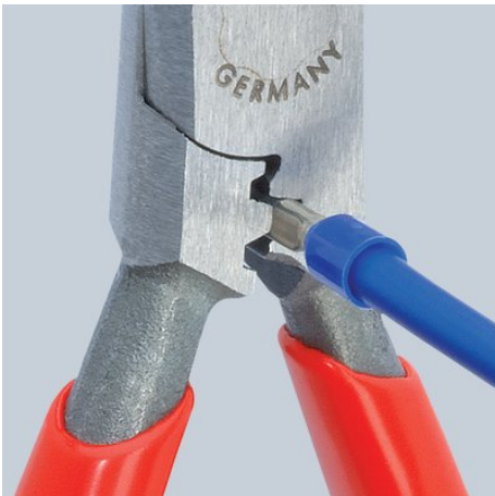
Crimping 0.5 to 2.5 mm 2